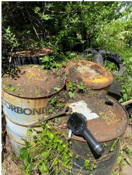
Contaminated 55-Gallon Drums

There will be some noise from the use of equipment, but work will be limited to Monday through Friday from 7:00 a.m. to 5:30 p.m.